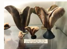
Fossils, Paleontological Museum, Cortina

The permanent exhibition at the South Tyrol Museum of Archaeology in Bolzano, Italy includes Ötzi the Iceman: a mummy from the Copper Age, 5300 years old.