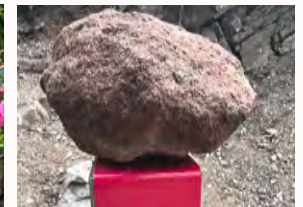
Geological Trail, Latemar