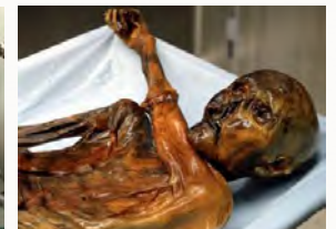
Ötzi the Iceman, Museum of Archaeology in Bolzano