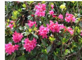
Botanical Trail, Latemar

The botanical path Dos Capèl - Gardonè presents an extraordinary blossom of rhododendron, wood anemones, stone-breaks, gentians, green alders and juniper bushes. Latemar's rocks and fossils in the Geological Trail from Passo Feudo tell the tale of a tropical sea and large volcanoes in the area that is now the Dolomites.