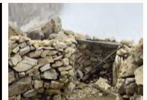
Trenches Open Air Museum WW1, Cinque Torri