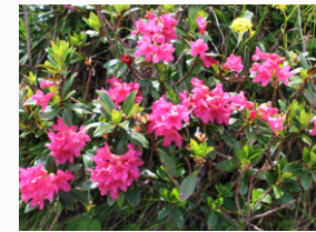
Botanical Trail, Latemar

The botanical path Dos Capèl - Gardonè presents an extraordinary blossom of rhododendron, wood anemones, stone-breaks, gentians, green alders and juniper bushes. Latemar's rocks and fossils in the Geological Trail from Passo Feudo tell the tale of a tropical sea and large volcanoes in the area that is now the Dolomites.