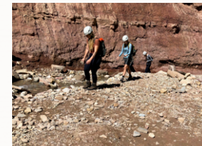
Fossils hunting in the Bletterbach gorge

Hiking the Bletterbach gorge means undertaking a journey through millions of years and go hunting for animal and plant fossils that disappeared forever. The permanent exhibition at the South Tyrol Museum of Archaeology in Bolzano, Italy includes Ötzi the Iceman: a mummy from the Copper Age, 5300 years old.