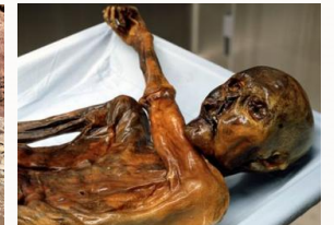
Ötzi the Iceman, Museum of Archaeology in Bolzano