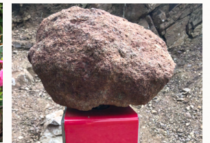
Geological Trail, Latemar