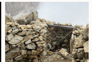
Trenches Open Air Museum WW1, Cinque Torri